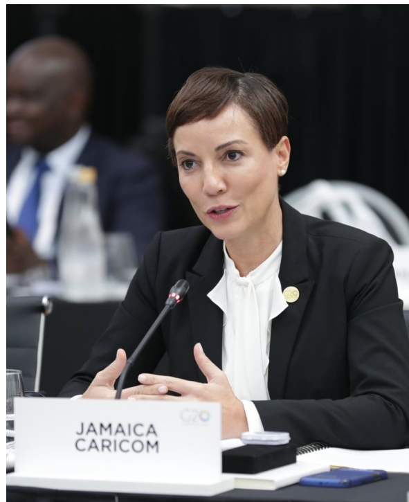
Senator Karmina Johnson Smith

Among charges against her—which she has defended—are allegations of impropriety in the awarding of a contract to a company owned by a personal friend.