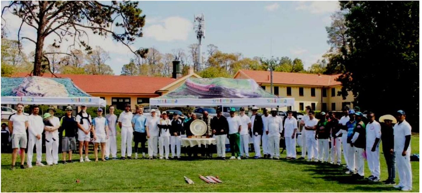
Teams from the Department of Foreign Affairs and Trade and The Commonwealth line up for the presentation of the Muttukumar trophy following the annual Cricket match at Canberra's Forestry Oval in March.

The annual cricket match between a team from DFAT and one representing Commonwealth nations in Canberra, was a grand finale to celebrations marking Commonwealth Week in Canberra.